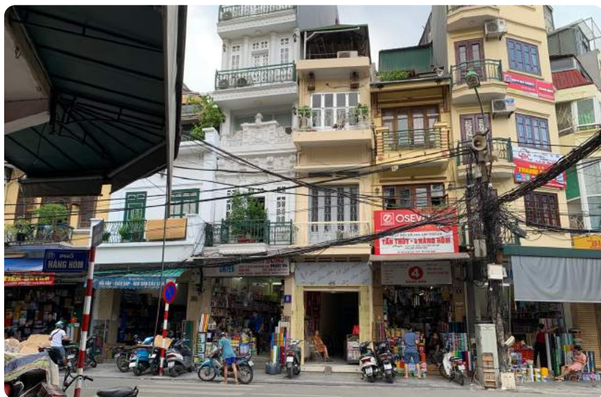
Figure 1. Paint stores along the famous Hang Hom street in Hanoi.