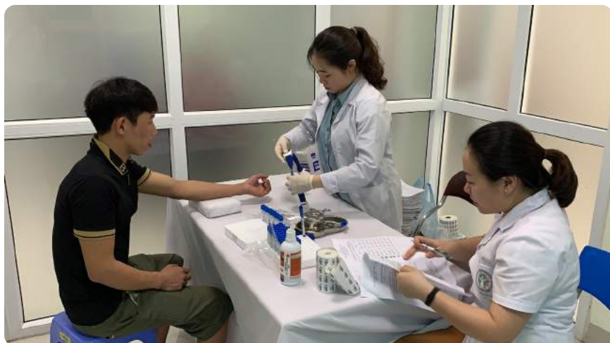
Figure 4. Extraction of a painter's blood sample for blood lead analysis.

The average blood lead level (BLL) among all 108 research subjects is 4.51 \mu\text{g}/\text{dL} , the lowest BLL is 1.29 \mu\text{g}/\text{dL} , and the highest BLL is 20.72 \mu\text{g}/\text{dL} . The average BLLs among 48 preschool children and 60 painters are 5.27 \mu\text{g}/\text{dL} and 3.90 \mu\text{g}/\text{dL} , respectively. The BLL difference between the two subjects is statistically significant, with a p-value of < 0.01 .